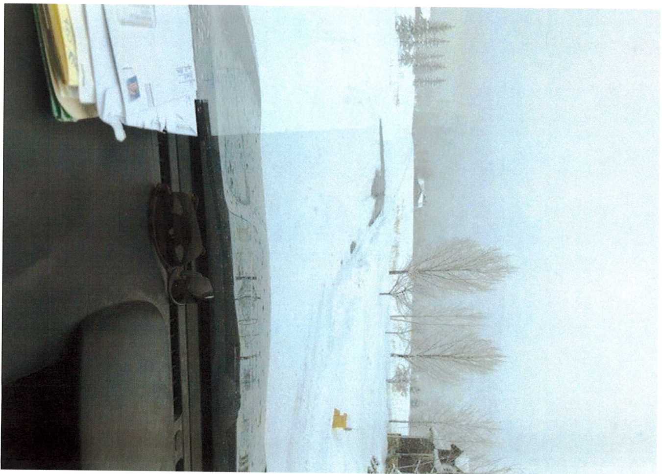
33 Tangle Trail